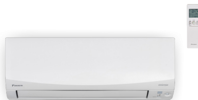
Daikin Heat pump FTZXM60UVMZ