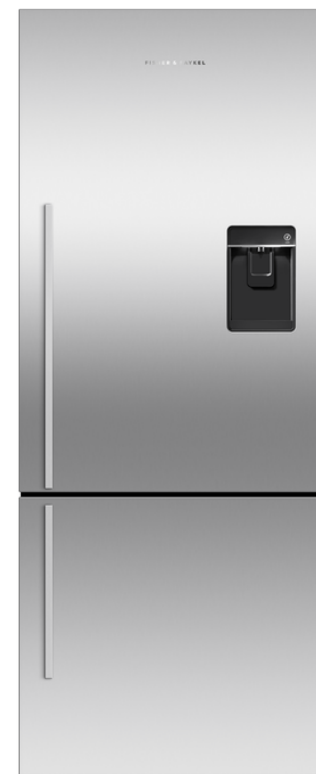
Fisher & Paykel 68cm Freestanding Refrigerator/ Freezer 413L E442BRXFDU5