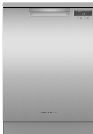
Fisher & Paykel Dishwasher DW60FC2X1